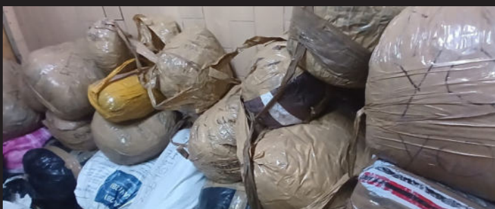
Multiple bags loaded with dagga with an estimated street value of R1 million

Police have appealed to members of the public who may have information related to the case to contact Witbank SAPS on 079 891 5570, call Crime Stop on 08600 10111, or submit information anonymously through the MySAPS App.