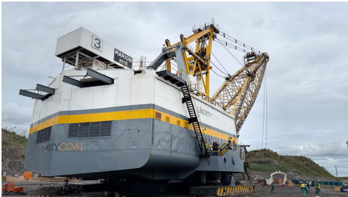
Optimum Colliery’s dragline, Marion 8200, has been given a new lease of life after a successful refurbishment programme costing R500 000