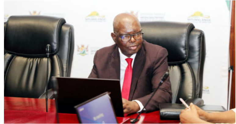
The Mpumalanga Finance MEC Bonakele Majuba unveiled R216 billion budget for a three-year spending plan (2026/27 – 2028/29), with R70,3 billion allocated for the 2026/27 fiscal year