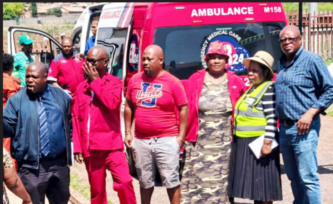
The EFF in Steve Tshwete says food safety standards must be monitored to ensure safety of communities within the municipality