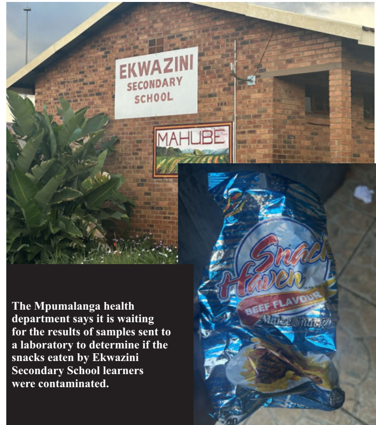
The Mpumalanga health department says it is waiting for the results of samples sent to a laboratory to determine if the snacks eaten by Ekwazini Secondary School learners were contaminated.

Department of Education spokesperson Gerald Sambo said the SGB is responsible for overseeing food sales at schools but emphasised that the wider community also has a role to play. He added that the department has issued guidelines and trained food handlers to ensure hygiene and safe food preparation.