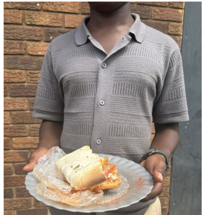
A kota loving customer finds fungus on the bread used to make his Kota.