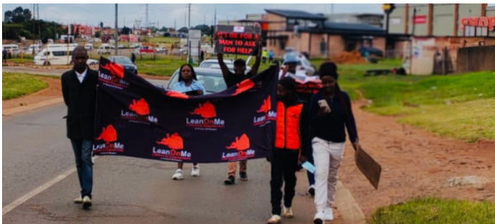
Lean On Me organisation during a community awareness walk from Mhluzi Mall to OR Tambo Park on Friday, 13 March