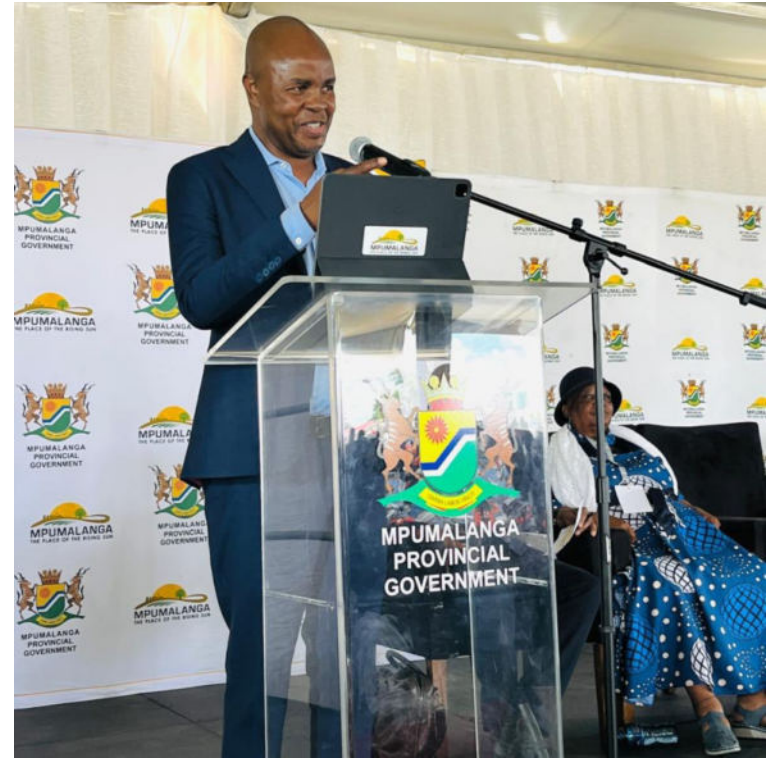
Mpumalanga Premier Mandla Ndlovu

In addition, the district municipality announced plans for water infrastructure projects to address ongoing water shortages. Agricultural support programmes were also introduced as part of efforts to tackle poverty in the community.