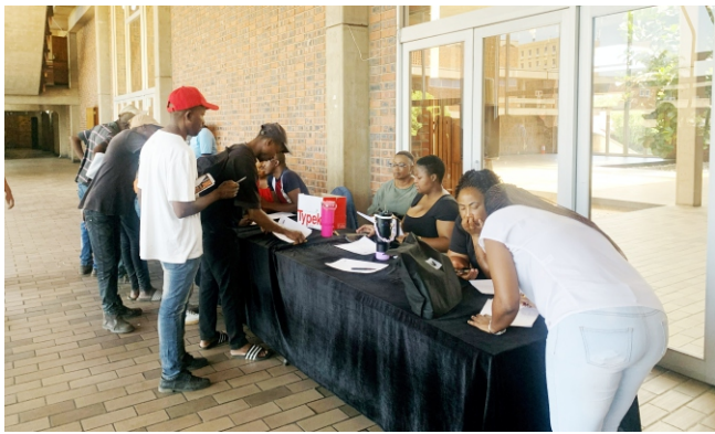
Community members registering for the unemployment database program.