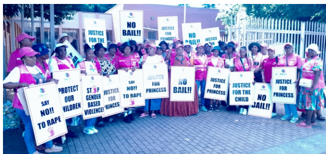
Members of the Delmas community, Delmas First Women and the ANC Women's League hold placards outside the Delmas Magistrate's Court on 4 February 2026 during the court appearance in a child rape matter that was transferred to the Regional Court.

incidents and seek assistance. "Victims should not remain silent." Some members of the community, Delmas First Women and the ANC Women's League gathered outside the court during the proceedings with placards reading, "No Bail for Rapists." They are demanding stronger action against sexual offences involving minors. The case has appeared several times before the Delmas Magistrate's Court and was previously postponed to allow police to finalise investigations and for the State to complete pre-trial preparations. Some earlier delays drew criticism from community members and civil society groups calling for faster progress in cases involving sexual offences against children.