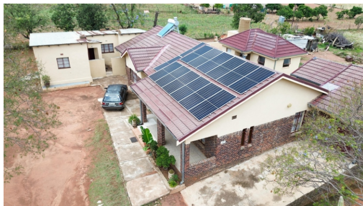
12 kW residential housing