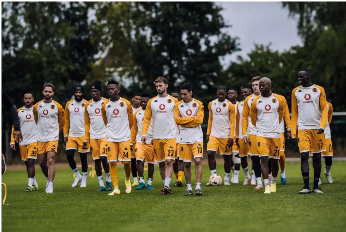
Kaizer Chiefs squad in training.