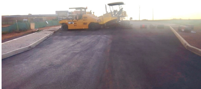
Taxis and ambulances drive on the same road to the newly constructed King Nyabela Hospital in Middelburg, as the department pushes back the completion deadline.

After the original completion date passed, Highveld Chronicle decided to reach out for clarity on delay. Dhlamini said, “The asphalt surfacing subcontractor closed on the 12th of December (construction holidays) so surfacing had to wait for them to come back,” he said. “We anticipate completion in February, the contractor needs 2 weeks to repair rain damages and 1 week for surfacing, if weather permits.”