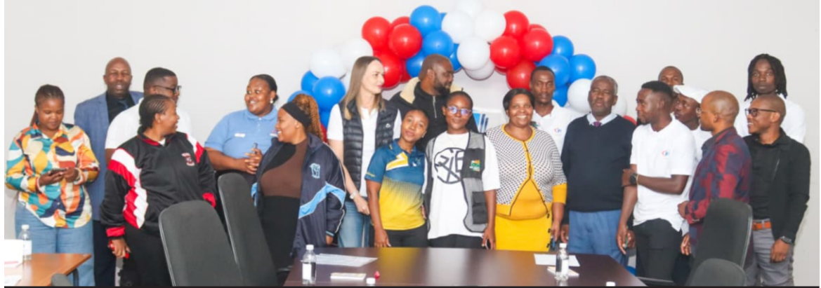
Loveducation team poses for a picture with education department officials