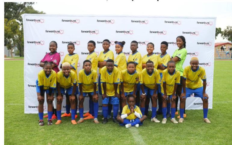
Mpumalanga Rising Stars Ladies, girls U15 champions