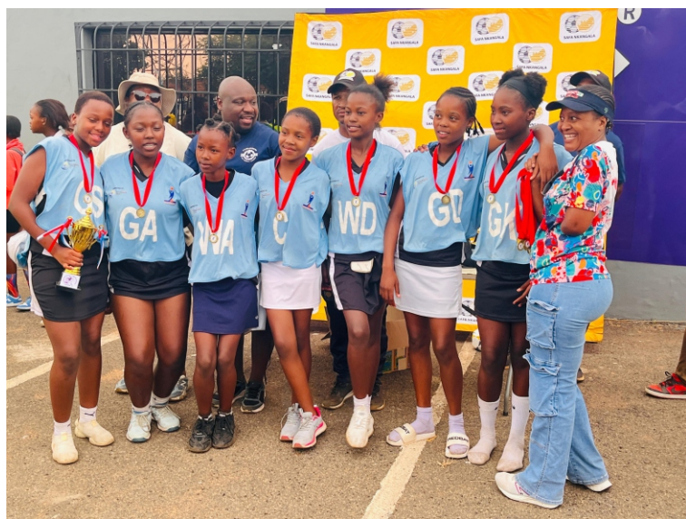
Apple Poison, the netball champions