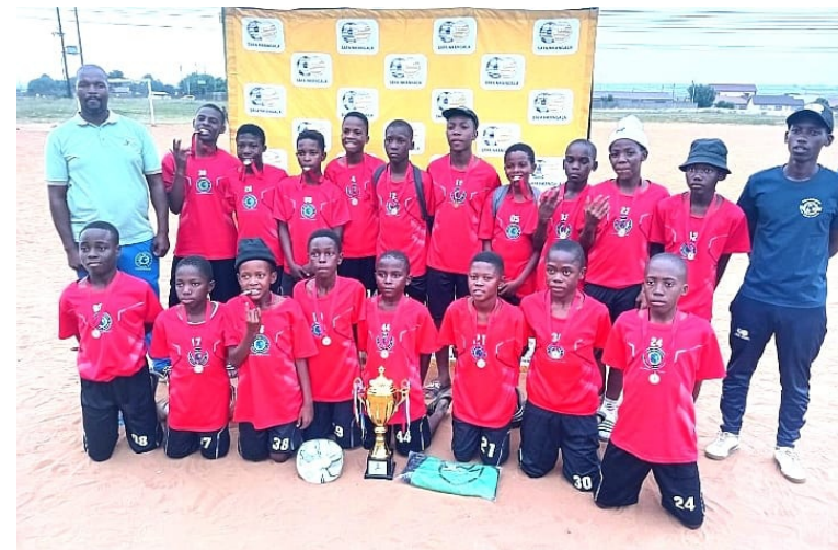
Blackburn Rovers, U15 boys champions

The event attracted support from coaches, parents and community members, highlighting the role of sport in promoting discipline, teamwork and confidence among young people in the Ezinambeni community.