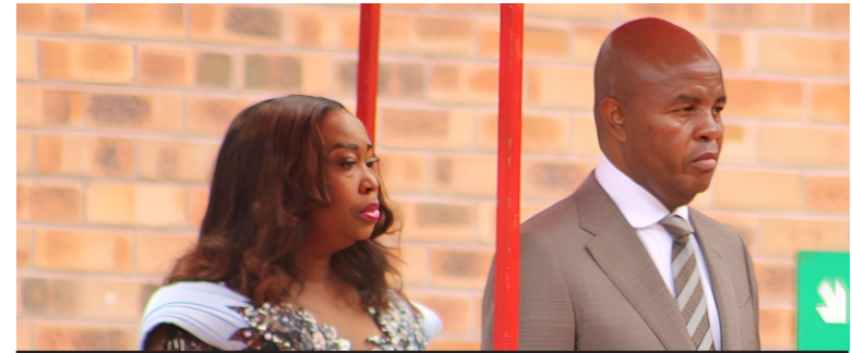
Mpumalanga Premier Mandla Ndlovu stands alongside Speaker of the Legislature Makhosazane Masilela

A flagship initiative stemming from the agreement is the hybrid rice project — a comprehensive industrial ecosystem expected to