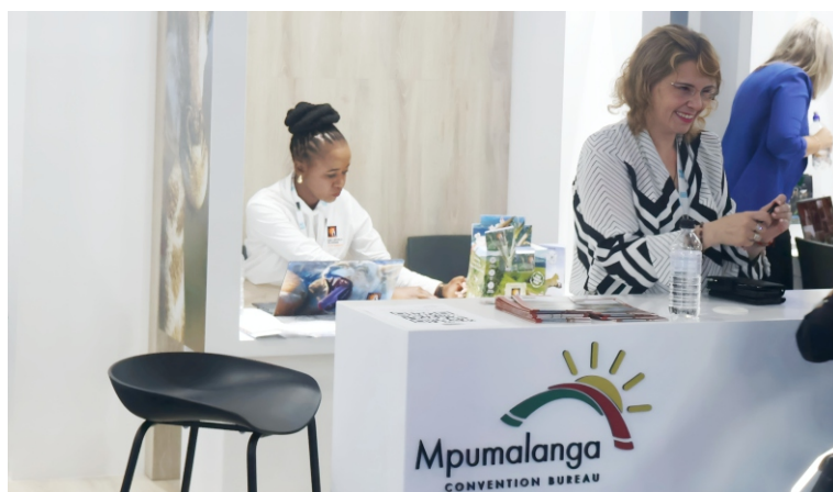
Mpumalanga Tourism and Parks Agency (MTPA) exhibition stand at the Meetings Africa